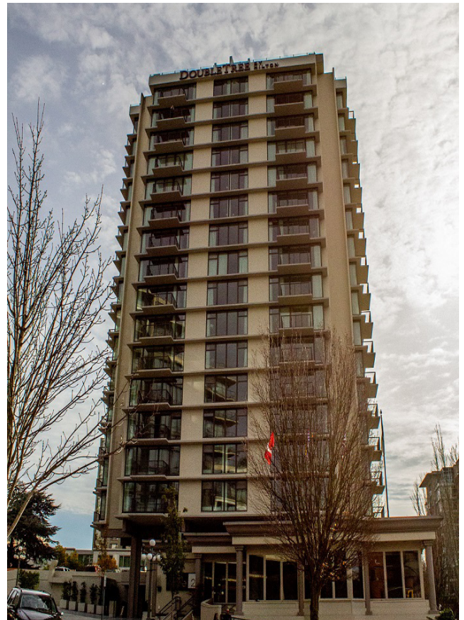
Double Tree by Hilton Hotel & Suites Victoria